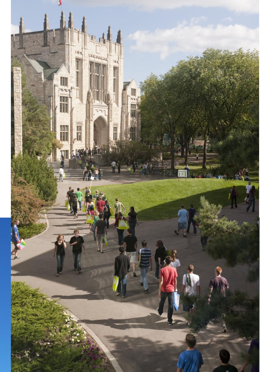
L-R: University of Saskatchewan (U of S), Northampton, UK; Sydney, Australia